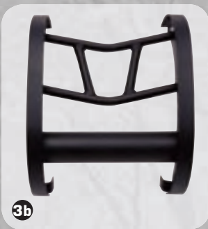
ABB-4KB34-10-00 . . . . . $157.95